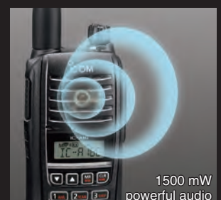
1500 mW powerful audio