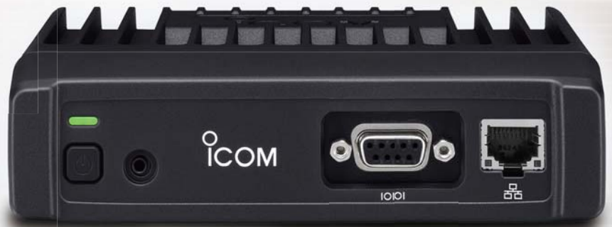
RS-232 + Ethernet Version