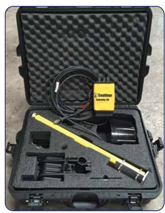
Rugged Peli-type shipping case