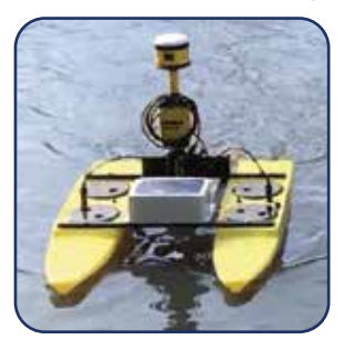
HydroLite-TM mounted on HyDrone-ASV