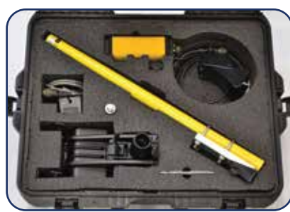
Rugged Shipping Case