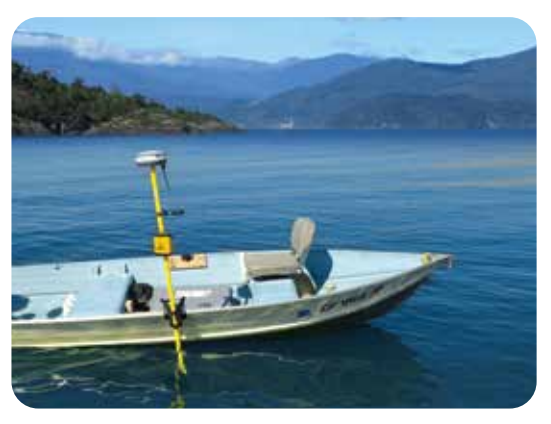
HydroLite-TM™ in lake.