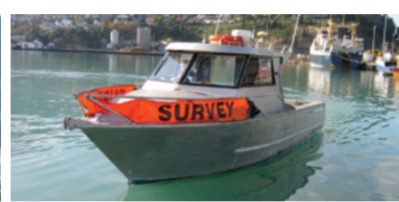
Trimble systems support construction and surveying workflows for data inegrity and reliability.