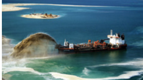
The Trimble Marine Construction systems provide the 3D position of the dredge head and displays it with the channel design. Precise information gives marine operators "eyes under water", to see exactly where material should be dredged.