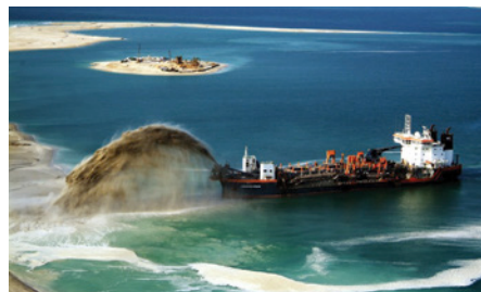
The Trimble Marine Construction systems provide the 3D position of the dredge head and displays it with the channel design. Precise information gives marine operators "eyes under water"; to see exactly where material should be dredged.