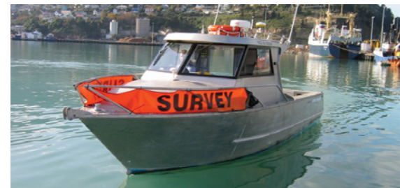
Trimble systems support construction and surveying workflows for data integrity and reliability.