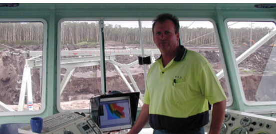
Trimble TDL 450 Series Radios provide robust UHF frequency solutions for use as repeaters or for work at longer ranges.