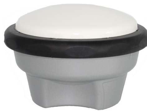
Part Number: 44830-10