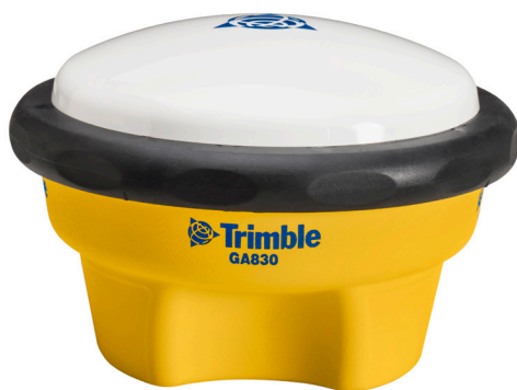
Part Number: 44830-00-INT