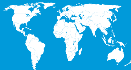
Location PARIS, FRANCE